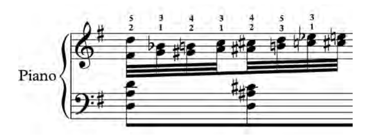
Example 19. Variation 23, bar 4. Wiener Pianoforte-Schule, vol. 3 (Starke 1821: 90)

1821). It was for the latter publication that Beethoven provided some fingerings, making it arguably the only work by another composer published with Beethoven's fingerings and, by implication, public endorsement. The number of Beethoven's entries is relatively modest, and, of the fingerings given, the following two examples stand out: