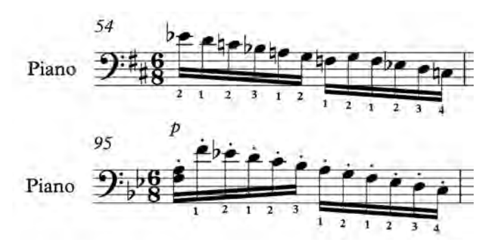
Example 8 . Trio for piano, violin and violoncello, WoO 39, bars 54 and 95 (in both cases, the left hand)

The repeated use of the first and second fingers also occurs in the left hand of bars 27–28, in which a sequence of nine notes is played by only two (!) fingers: