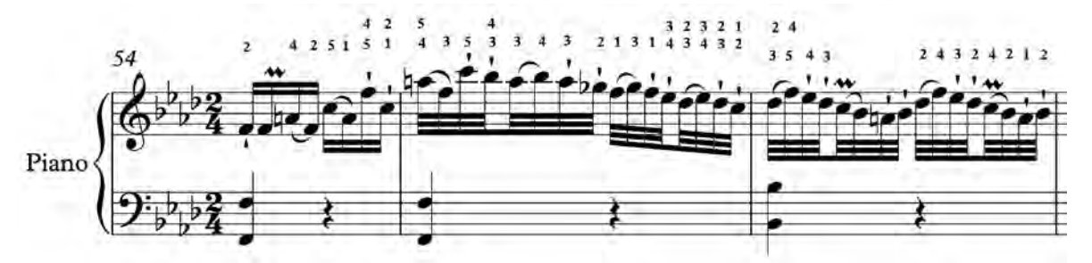
Example 4. Ladenburger 2003: 114

Ladenburger presents two versions of Beethoven's fingering for one particular passage, and this offers an insight into the composer's pianism, which is not fully explored in the article, at least not from a pianistic point of view.