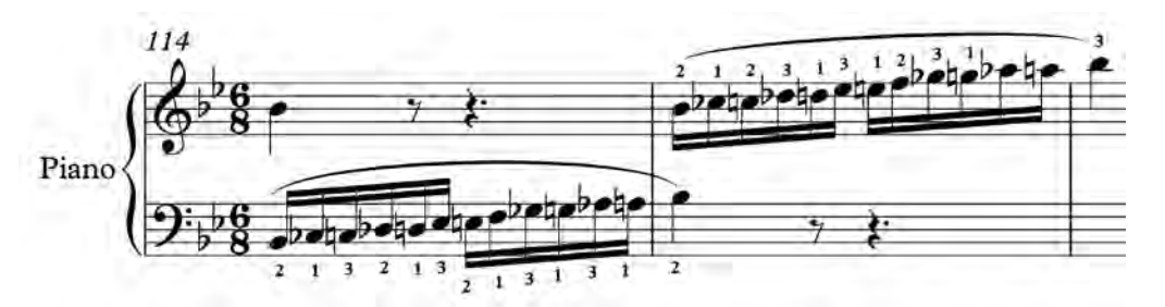
Example 7. Trio for piano, violin and violoncello, WoO 39, bars 114-115

The composer's fingerings also evidence some (at least within this piece) consistent approaches to the playing of scales, which can be seen in his approach to B-flat major (see Example 8), and the chromatic scale (see Example 7). In terms of chromatic patterns, Beethoven adopts a finger sequence in either hand that, were the player to put hands together, would promote corresponding finger numbers in both hands for eight out of twelve notes. This is in contrast to fingerings more commonly used today, which are based on five or six corresponding finger numbers when hands are played together: